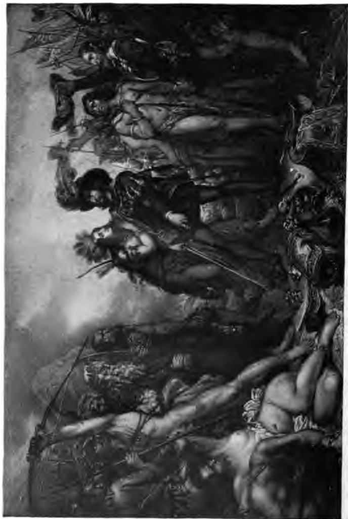
PIZARRO IN PERU